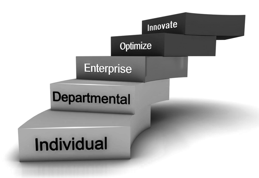
Figure 1.1 The Five Levels of the Information Evolution Model